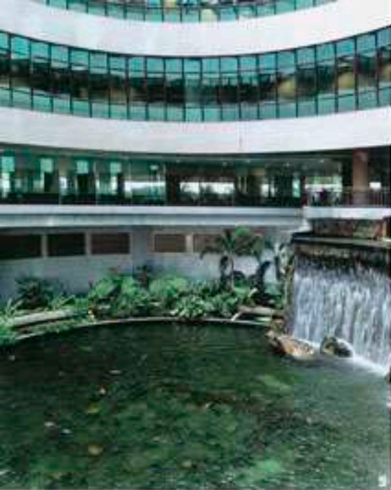
5 The koi pond and waterfall at the atrium