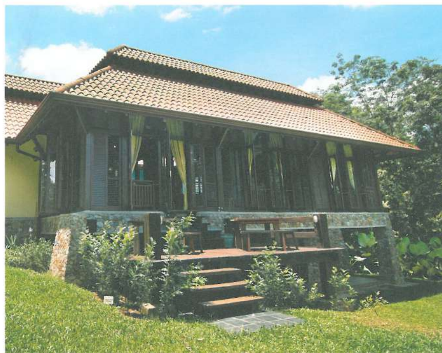
A dream weekend home built with recycled timber sourced from old shoplots, derelict houses and sawmills.

To 'make up' for all the timbers that have been used in the house, even though they were recycled, architect Almaz has planted several hardwood trees such as Chengal, Nyatoh, Kembang Semangkok, Teak, Damar Minyak and Merbau at the edge of her property. This is partly an experiment in tree-cultivation, and partly an attempt to leave a natural legacy for her children and grandchildren.