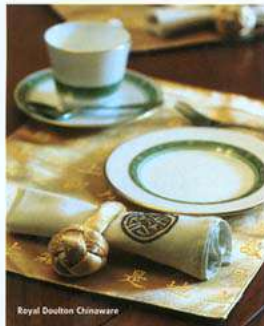
Royal Doulton Chinaware

"A pair of 17th century yoke back armchairs sit in the foyer area beneath an antique carving of birds made out of camphor wood"