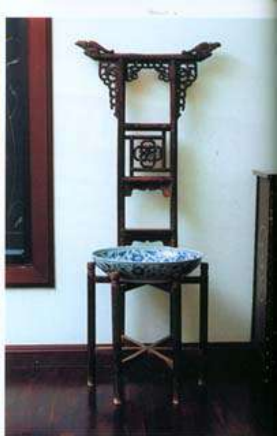
Clockwise from left: A sculpture piece by Loh Ek San takes prominence in the lanai. An antique washbasin from the Qing Dynasty. The high ceilings at the Lee's home provide ample ventilation. The master bedroom bathroom.