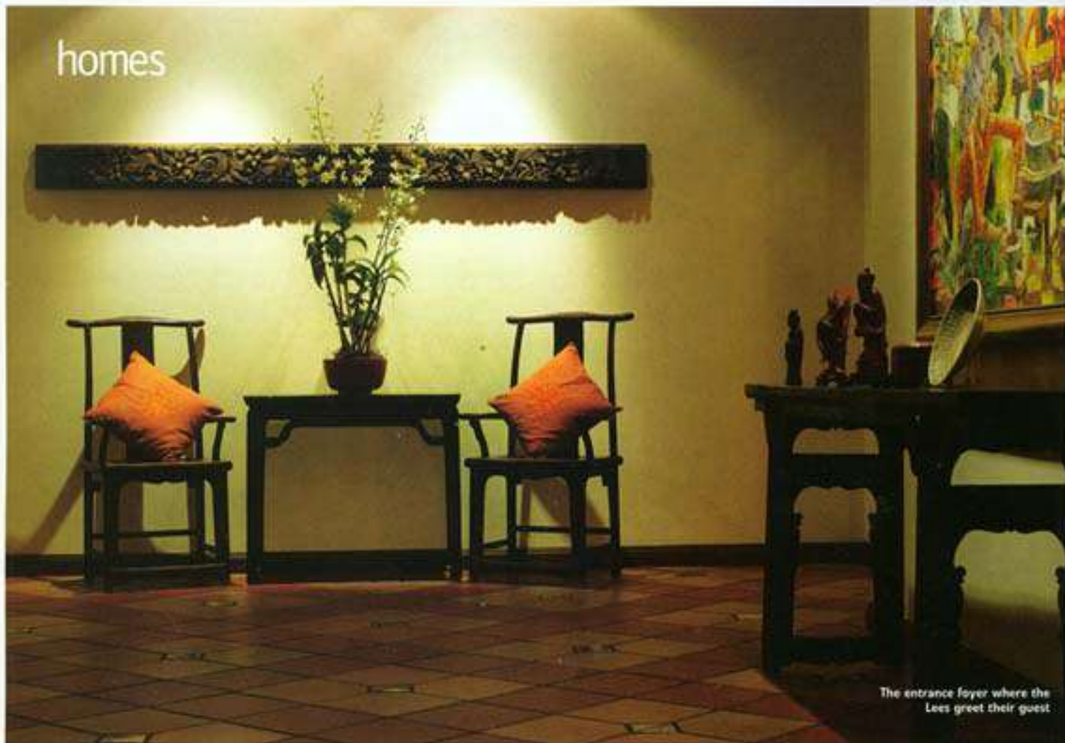
The entrance foyer where the Lees greet their guest

"A pair of 17th century yoke back armchairs sit in the foyer area beneath an antique carving of birds made out of camphor wood"