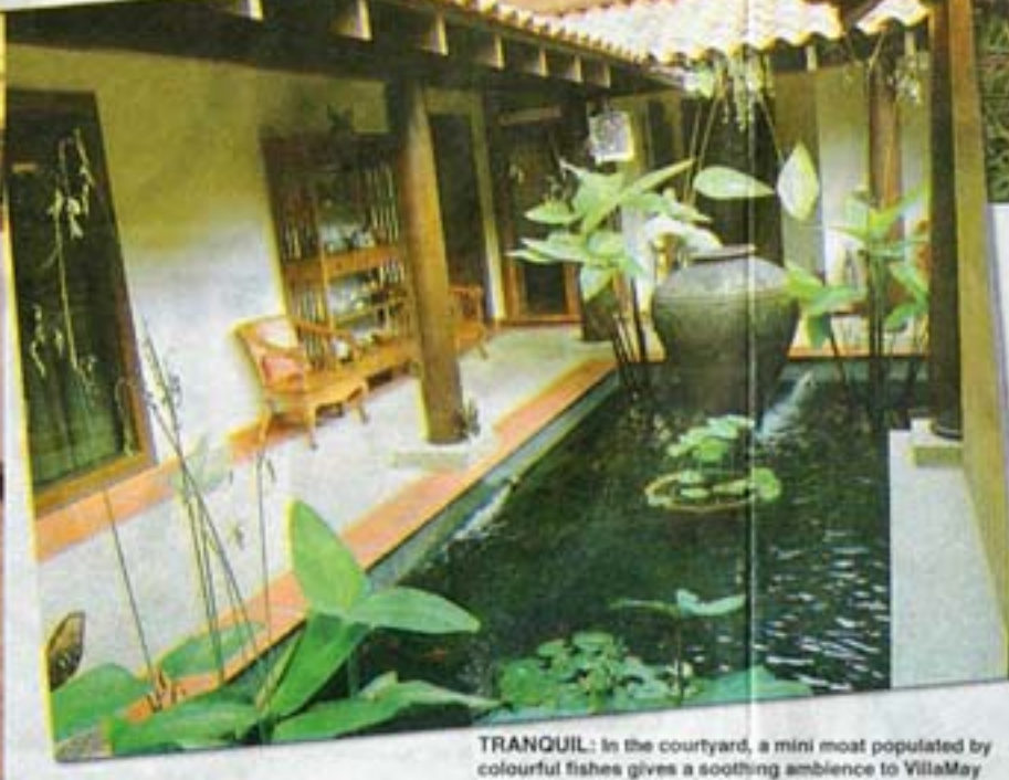
TRANQUIL: In the courtyard, a mini moat populated by colourful fishes gives a soothing ambience to VillaMay