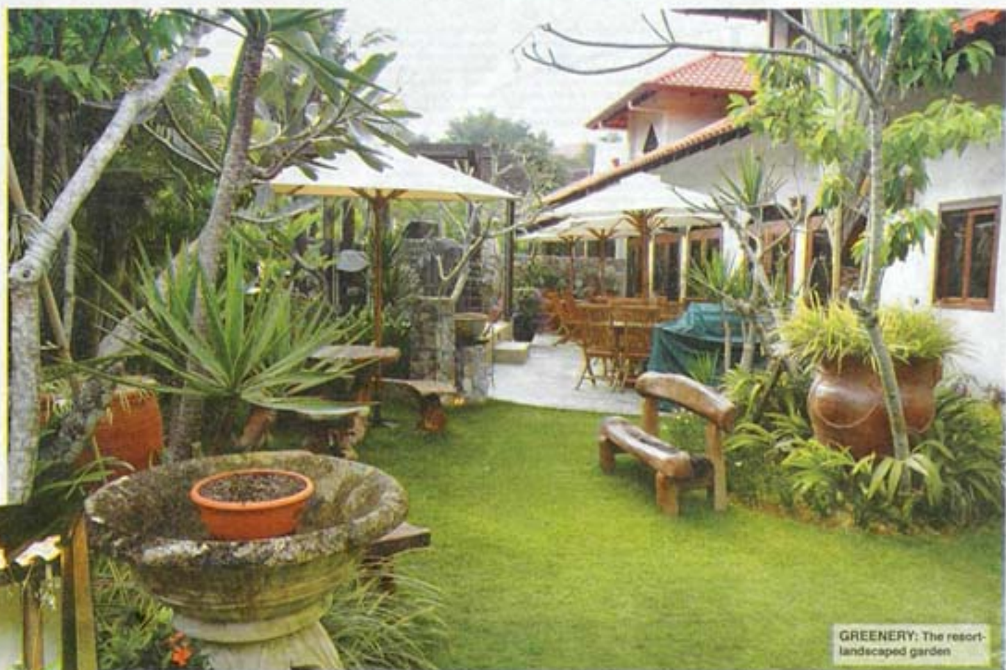
GREENERY: The resort-landscaped garden

■ VillaMay is located at No 22, Jalan Baiduri 7/7B, Seksyen 7, Shah Alam. Tel: (03) 5510-4433.