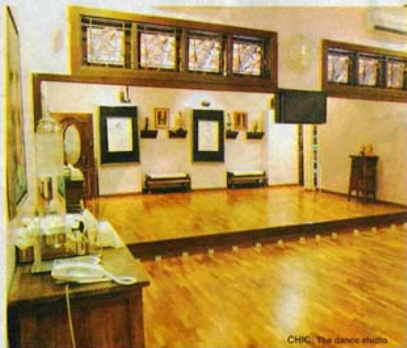
CHIC: The dance studio