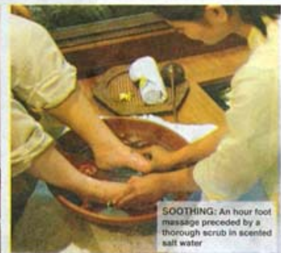
SOOTHING: An hour foot massage preceded by a thorough scrub in scented salt water