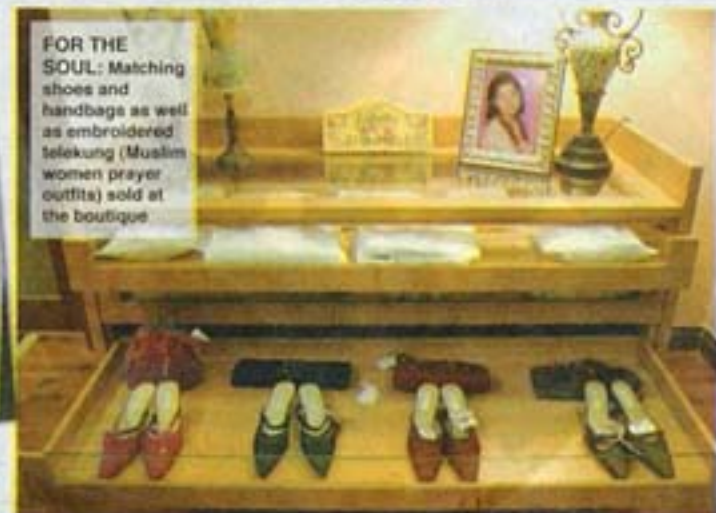
FOR THE SOUL: Matching shoes and handbags as well as embroidered telekung (Muslim women prayer outfits) sold at the boutique